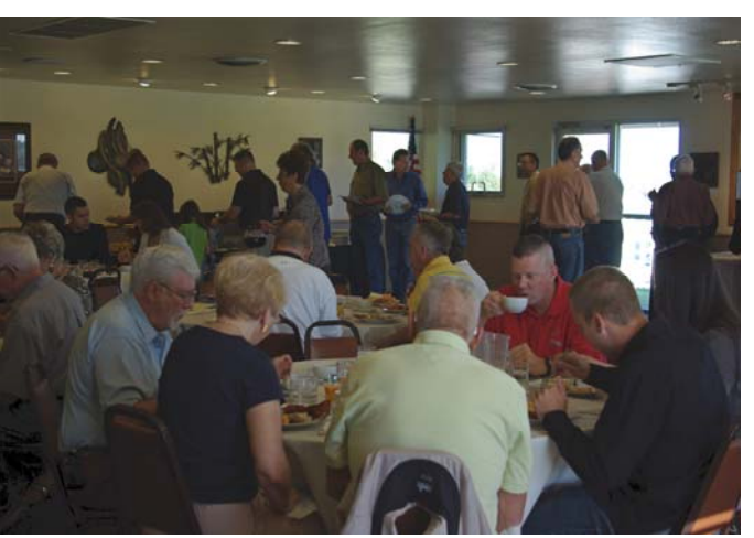
Lots of additional photographs available on CD. Just let the Editor know.