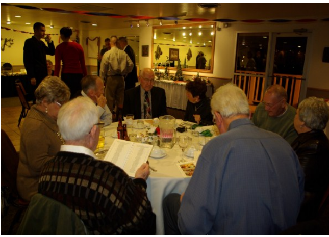
Many additional photographs available. Contact the "ECHOES" Editor.